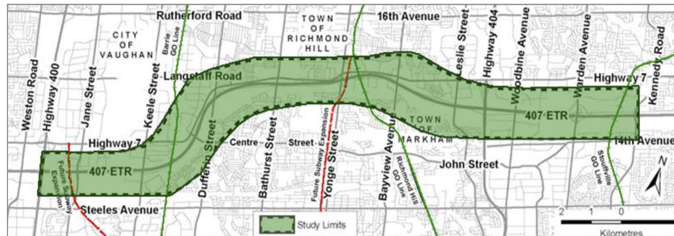
Figure E-1: Study Area

The scope of this study was the planning and preliminary design of the 407 Transitway, maintenance facilities and stations to accommodate an initial bus service with provision for future conversion to Light Rail Transit (LRT), including local bus access to and egress from the stations, platforms, access to and from the adjacent arterial road, parking, passenger pick-up and drop-off (PPUDO), buildings, shelters and other miscellaneous amenities.